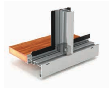
Patented mullion connection system