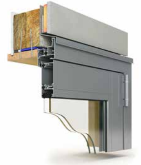
Hinge Door Head